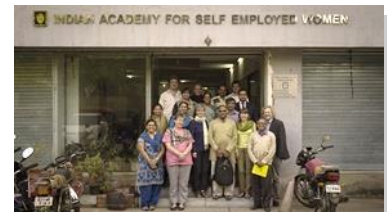
PRAYAS and SEWA members at the Stakeholder-Workshop

The twelve-day programme included visits to cotton fields, de-seeding plants, conventional or GOTS (Global Organic Textile Standard)-certified spinning mills, small dyeworks, weaving mills and to homeworkers, as well as conversations with trade unions, agricultural experts and a one-day Stakeholder Workshop.