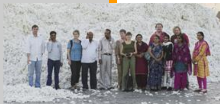
Members of the CCC and others in a factory to deseed conventionally grown cotton