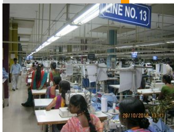
Seamstresses in Line 13 at ALOK Ind., Silvassa, India

From 2 to 14 January 2015, the members of the Clean Clothes Campaign (CCC) visited Ahmedabad, India, in order to gather information on the working and environmental conditions in the value chain from planting to selling. Partners in Ahmedabad were PRAYAS, an NGO which unionizes migrant workers and supports them in legal cases, as well as the SEWA - Academy, an educational institution of the Self Employed Women’s Association (SEWA).