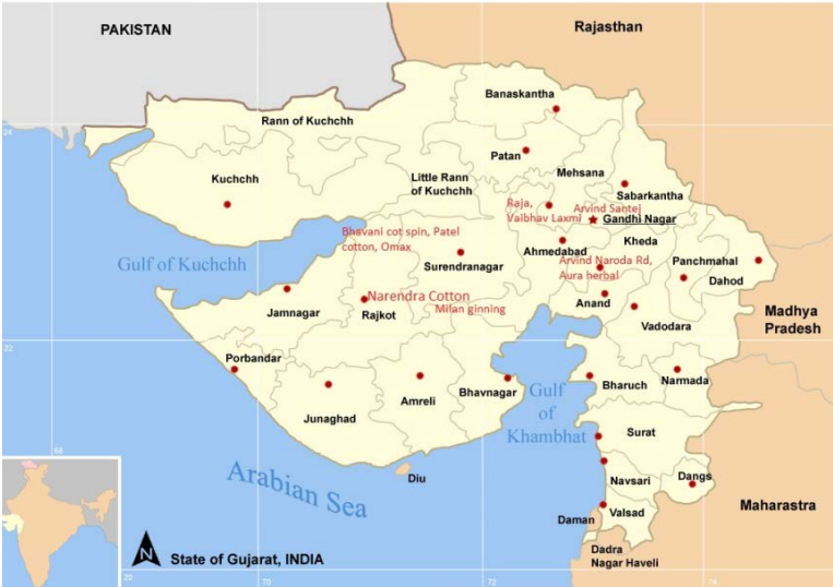
Figure 1: Location of the ginning factories surveyed on a map of Gujarat

In line with the structure of the questionnaire on which the interviews were based, the following statements sum up the results of the survey among 101 interviewees, as well as those of the two group discussions. The summary table with which each section closes (from Ch. 2.2 onwards) provides a company-specific overview of the workers' responses.